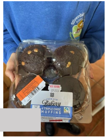
Fairtrade produce shopping!