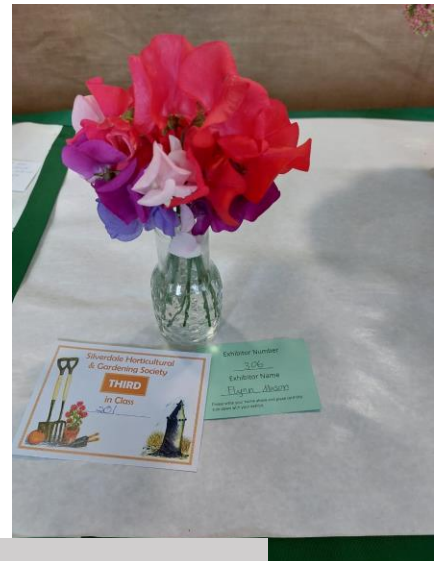
Horticultural show entries